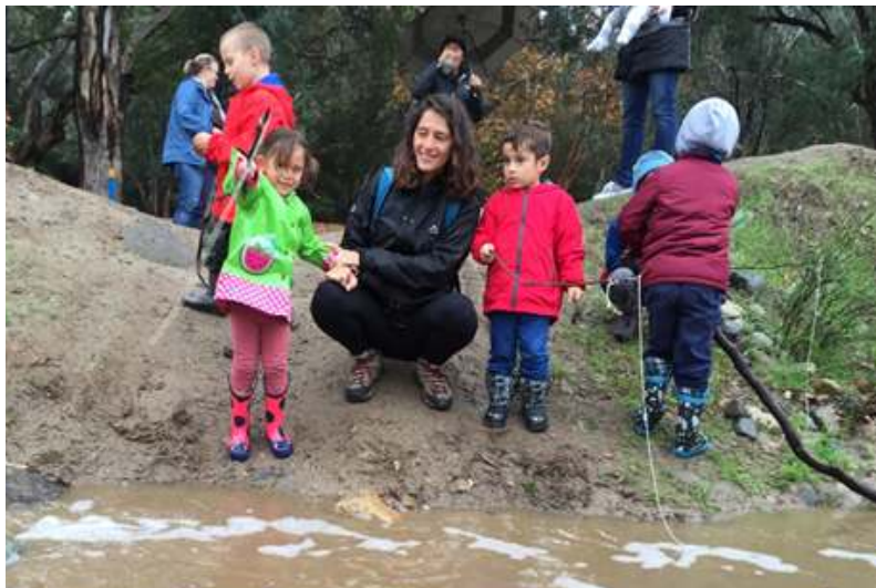
Forest Kindergartners enjoying the abundant water flow of Trabuco Creek.

students. These children, ages 3 - 6, along with their parents, gain confidence in nature, physical strength, camaraderie with their peers and build a true community of families connected with nature.