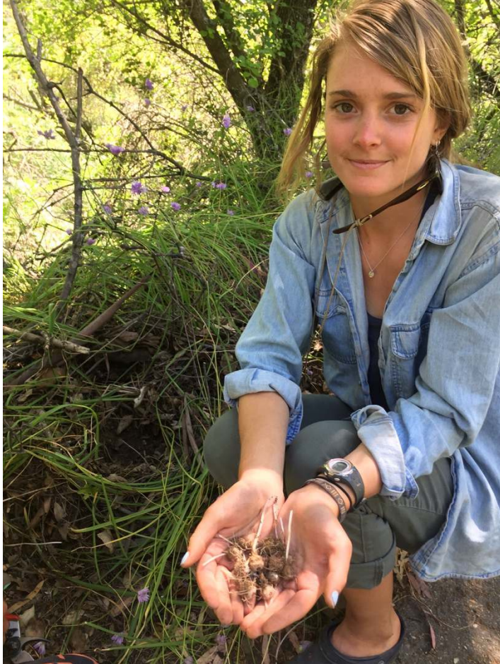
Naturalists at Large educator displaying Wild Hyacinth transplanted as part of the habitat restoration portion of the Eco-Literacy Training.

Earthroots instructors spent 3 days this past Spring with Naturalists at Large educators offering training on Ecological Literacy and Sustainable Living, partially funded by the Nature Connection Mentoring Foundation. Thirty five Naturalists from all over the state experienced the beauty of Big Oak while being immersed in this hands-on training. Each year this group impacts thousands of students throughout California. Earthroots provided instruction on Bird Language, Habitat Restoration, Native Plants as Food & Medicine, Composting, Organic Farming and Natural Building, among many other topics. These inspiring experiences will continue to enhance their programs for years to come.