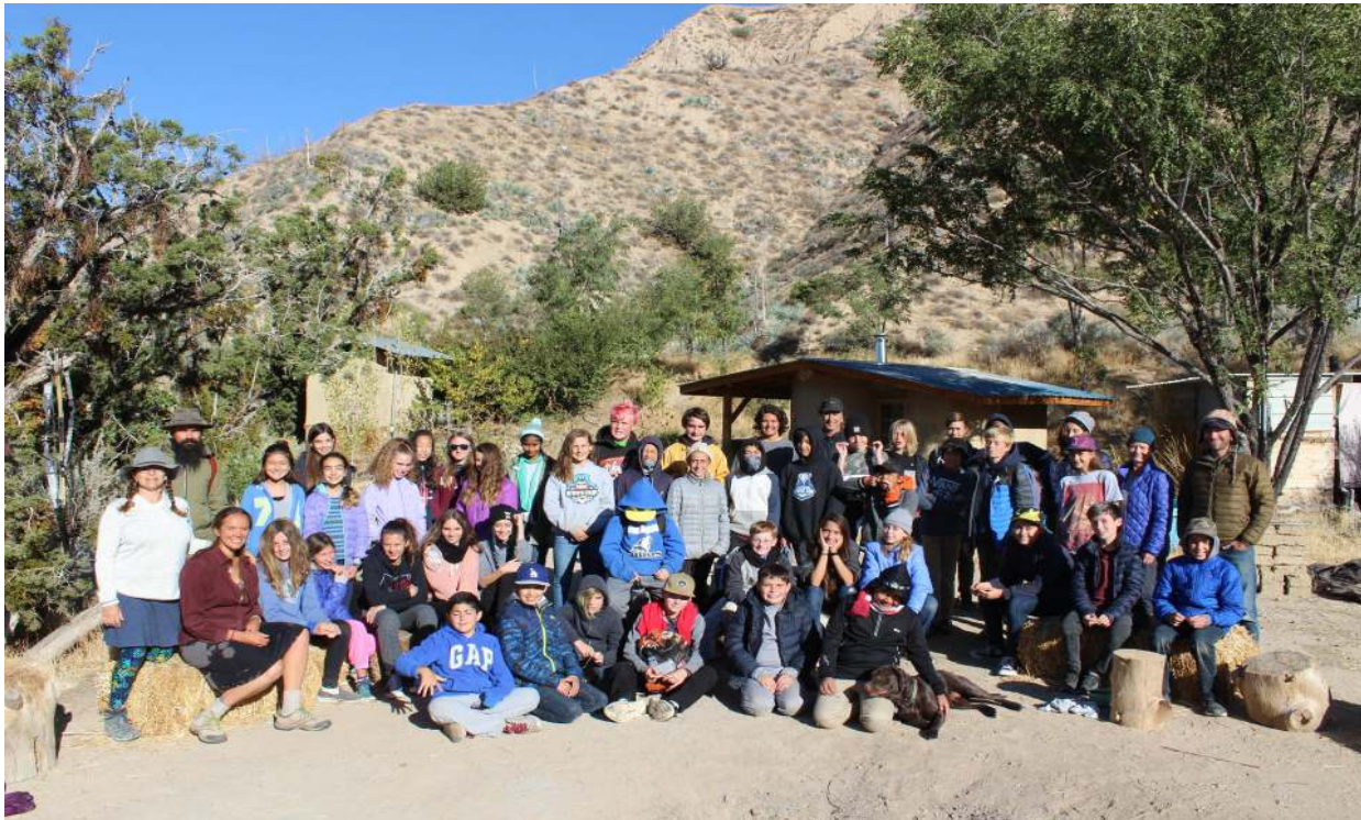
2017 Quail Springs Camping Trip with 7th grader Eco-Literacy students from The Journey School

Eco-Literacy on Campus is a weekly program for grades 2-8 held at a local elementary school. Now in its 9th year the program at this site has become a true demonstration of sustainable living practices, mentoring 160 students each week during the school year. Teachers, students, volunteers and administrators actively engage in growing fruit and vegetables, harvesting rainwater, composting lunch waste, recycling, minimizing single use containers and restoring native habitat. Our unique grade appropriate Eco-Literacy curriculum builds future environmental stewards for the next generation.