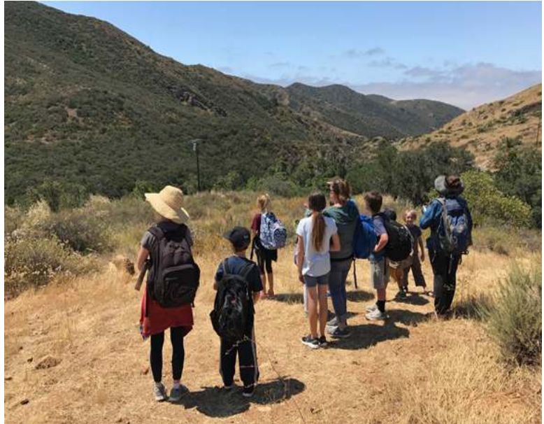
View from Hot Springs trail in San Juan Capistrano

What better season to spend outside learning in nature than summer time! Earthroots offered two summer camps this year: Primitive Skills Camp and Fairy Garden Camp. Primitive Skills Camp participants (ages 6-14) had adventures together learning about various local ecosystems and rediscovering ancient ways of living. Fairy Garden Camp explored the wonder of nature and the magic that it holds through plant and animal identification and fairy garden house building (children ages 3-7). Seventeen students spent 15 hours in nature this summer