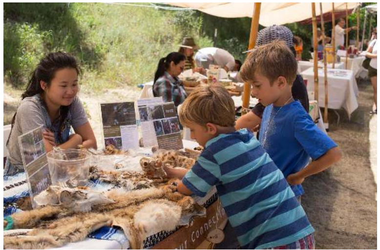
Children at the festival exploring the touch table booth.