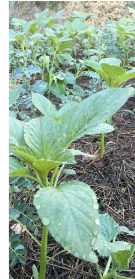
Golden giant amaranth and garbanzo beans

Inter agency partnerships are important to us in the canyon. With a helicopter pad on site, Big Oak has been used by OCFA for fire safety and emergency response for decades. Recently, Southern California Edison used the site to assist with a local pole repair.