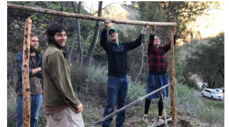
(Right) Creating shelter using pine and yucca.

tracking. They learned about identifying and interpreting local animal tracks and sign, including how to age tracks, then went on an off-trail adventure to find deer by following their tracks. During the Fiber session, participants learned how to process different types of plant and animal fibers, spin them into yarn, and do simple weaving and braiding. The practices of gratitude, creativity, and awareness were encouraged throughout the series. This was a series of 7 daytime classes throughout the spring for ages 8 and up. A total of 13 participants attended one or more sessions.