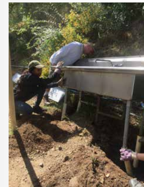
Rockwell Automation installing wash basin at Big Oak Canyon