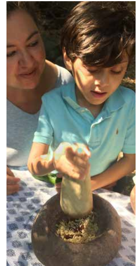
Mother and son using a grinding stone at Big Oak Canyon

Thanks to a third year grant from the Mara W Breech Foundation, Earthroots instructors have further expanded their deep nature connection trainings to enhance our breadth of offerings to the community. In the last few months, three Earthroots instructors have attended 15 days of workshops and trainings in Permaculture Design with San Diego Sustainable Living Institute and Coyote Mentoring with the