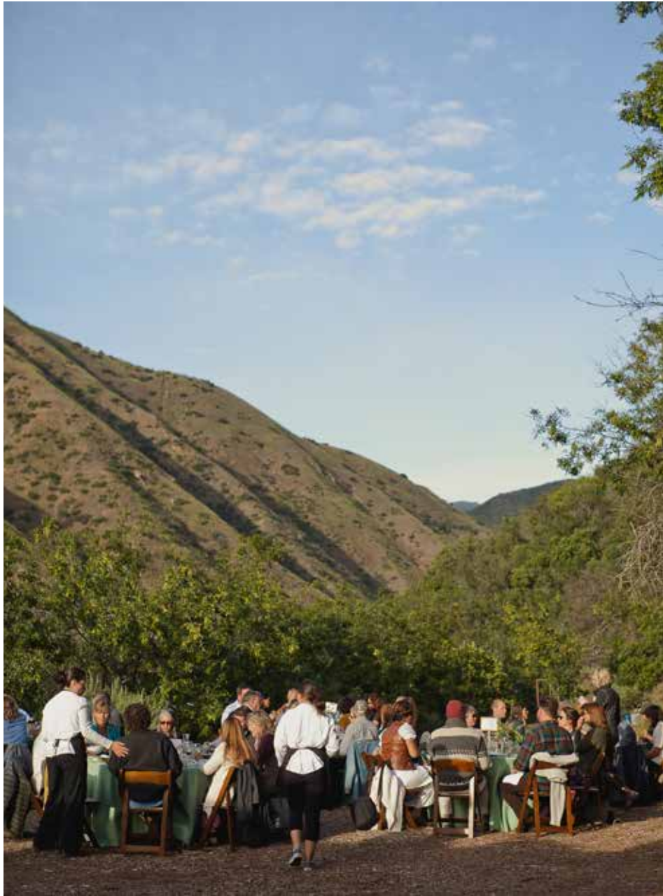
"Evening Under the Oaks" fundraising dinner.