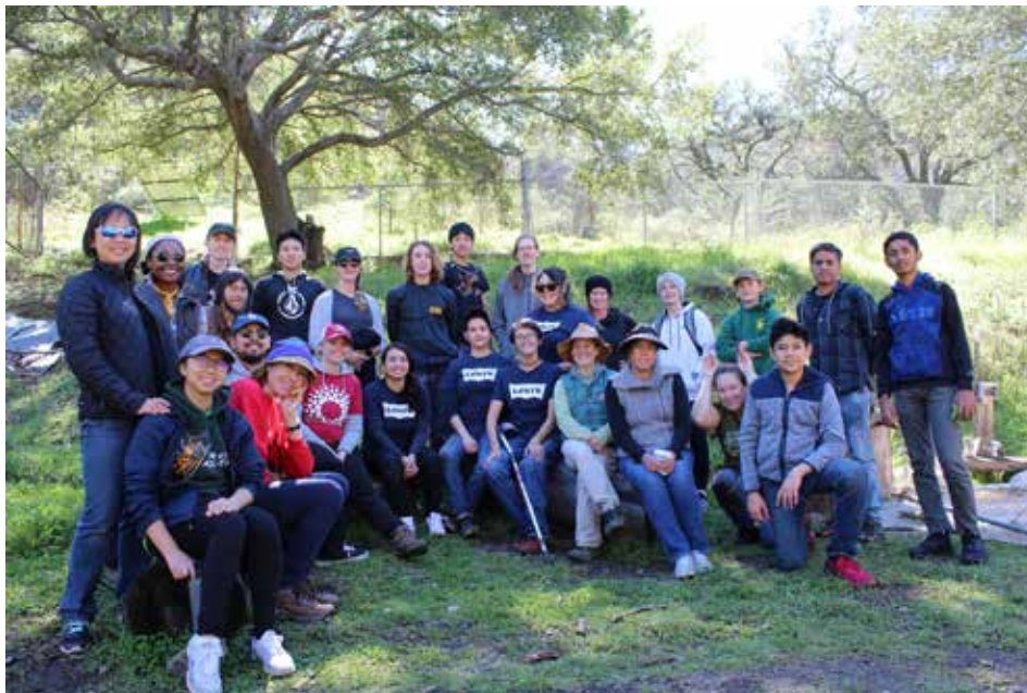
Volunteers at Big Oak Canyon