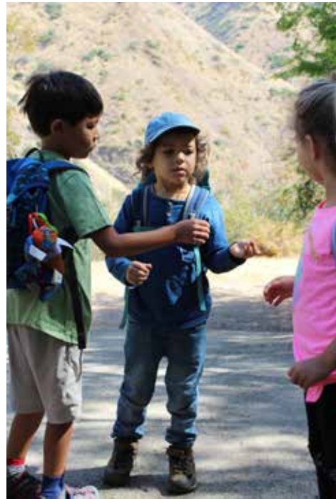
Forest Kindergarten (above) and Homeschool Field Class (below) at Big Oak Canyon