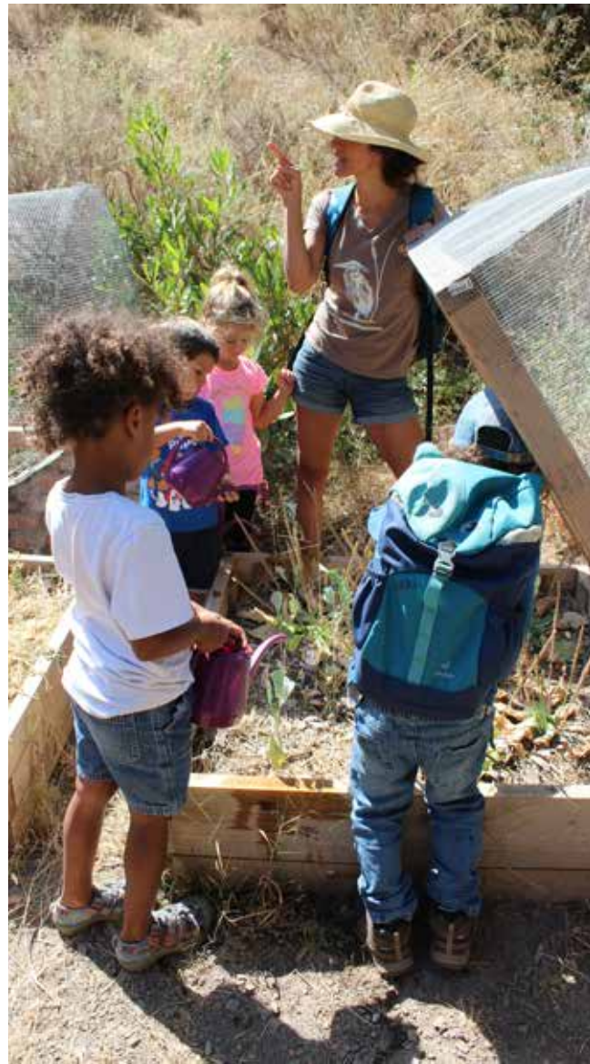
Children's Garden at Big Oak Canyon