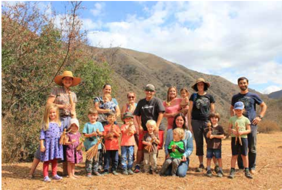
Forest Kindergarten (left) class showing their newly made cattail dolls (right) snack time