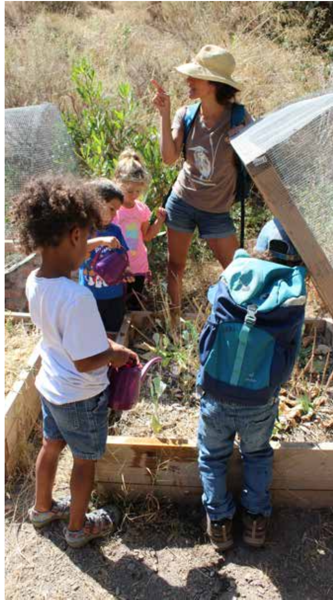
Children's Garden at Big Oak Canyon