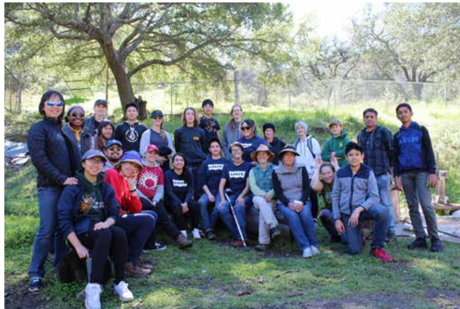
Volunteers at Big Oak Canyon